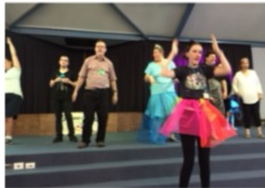
Our talent night.

We had a wonderful time at Crossroads last year. One of our evenings we dressed up as our favourite rock star. It was so much fun! We made a big circle and everyone got to chat about who they were dressed as. The last evening for the year we had a talent evening. There was lots of singing, dancing, rapping and even a true story told by one of our Crossroaders. This year we had a summer celebration for our first meeting. We did ribbon dancing, made craft and enjoyed summer games. Look at our lovely photos to see how much fun we have!