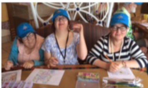
Fun at a Crossroads Holiday!