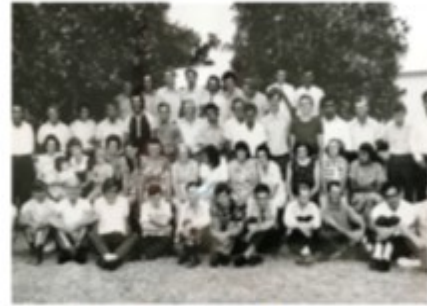
Westhaven Group Photo

Westhaven has a very positive profile in Dubbo with its dedicated staff and well adjusted residents who enjoy being part of the community.