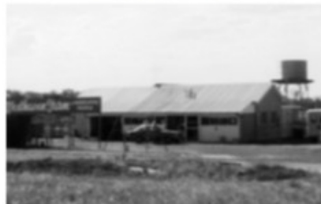
Westhaven Farm 1974