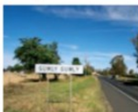
Gumly Gumly and Dog on Tucker Box

On Sunday we left early and had a stop at the Dog on the Tucker Box, where there was a gift shop which proved rather popular. We stopped for lunch at McDonalds along the way before heading home. I think everyone had a great time.