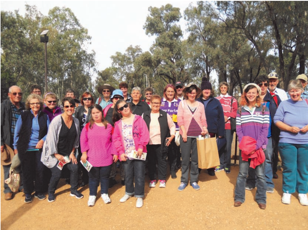
Above: Mudgee Crossroaders at Dubbo Zoo