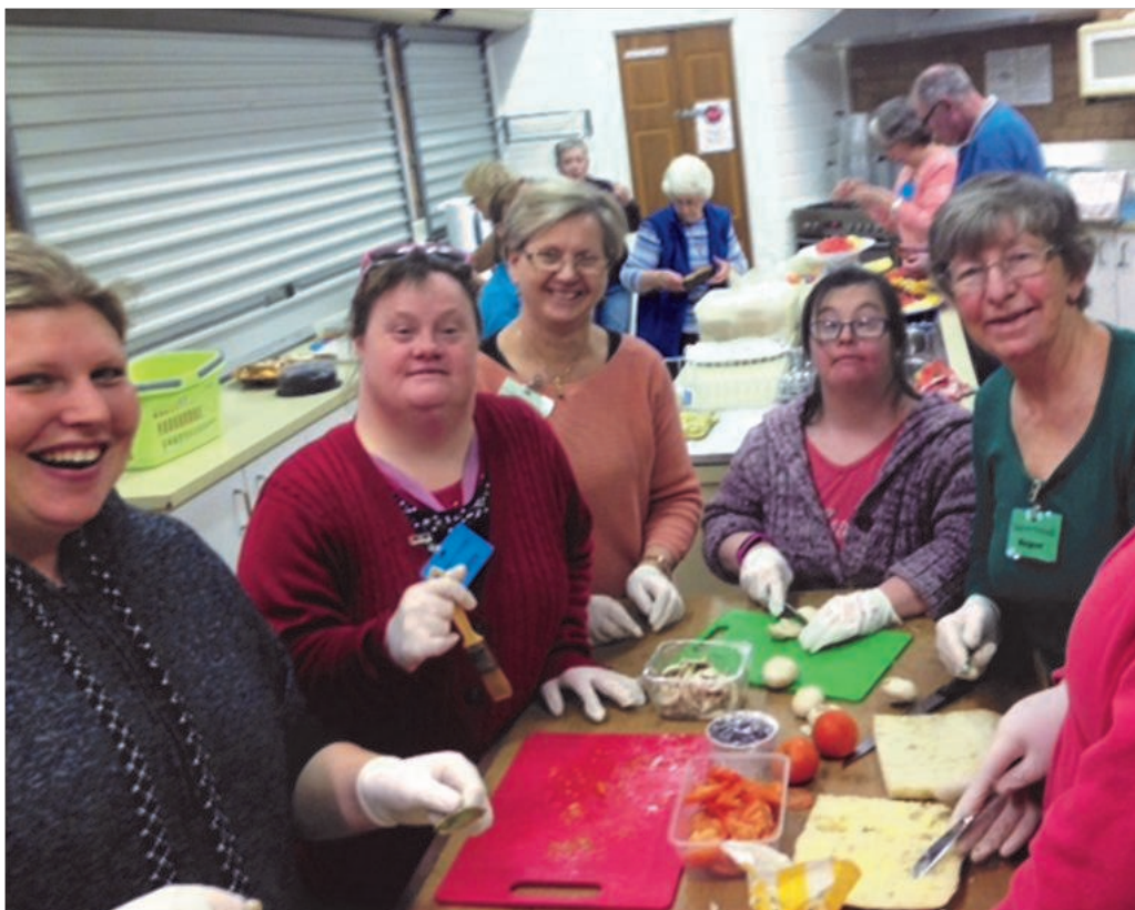
Above: Willing workers and busy hands preparing Supper for Crossroads in September