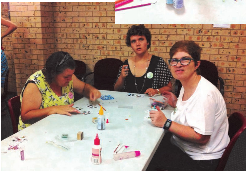
Left: Craft is always so important and these three lovely ladies enjoyed every minute