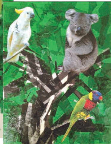
Above and right: Three beautiful decoupage canvases of Australia

Crossroads News is a publication of Crossroads Christian Fellowship NSW INC. It serves to be a voice for Crossroads Christian Fellowship as well as being a forum for ideas to help stimulate thought and action.