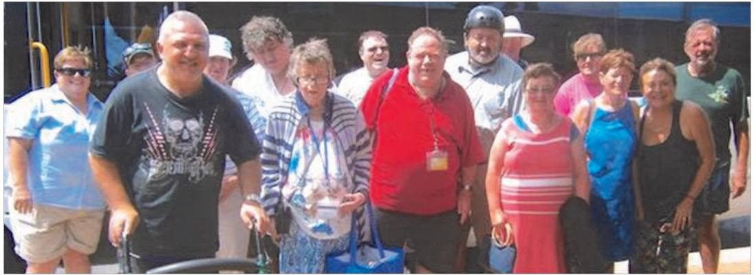
Above: Enjoying our outing to Homebush