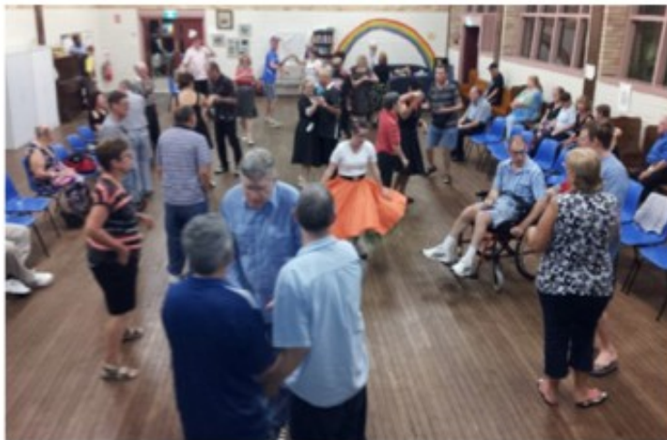
An evening with the Newcastle Rock and Roll club.

We are planning some outings a little later in the year with plans already underway to attend Les Miserables at the Civic Theatre, presented by the Newcastle Metropolitan Players, and due to be performed in the latter part of 2017. Meanwhile our Thursday evening programs are continuing as normal.