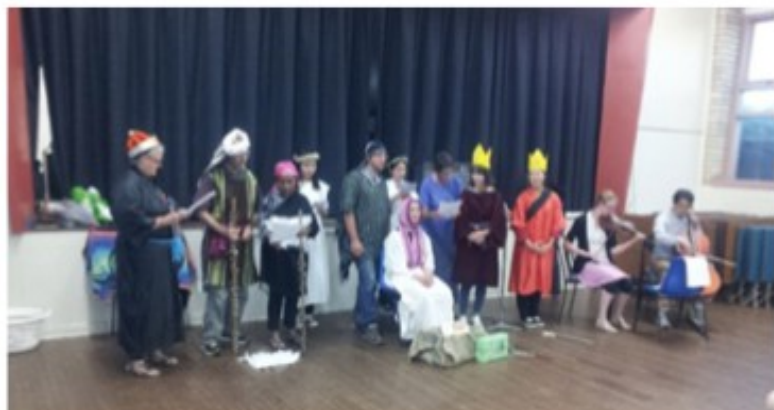
The Christmas Story