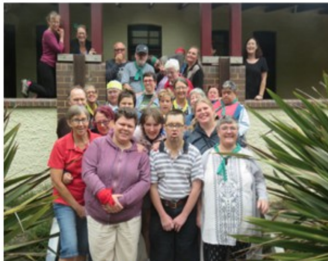
The Happy Campers at Bundanoon.

The camp was well attended this year. There was lots to do - bushwalking, a trip into town, swimming and games, and helping with food preparation. Everyone had a great time, and the planning and preparation of the organisers is always very much appreciated!